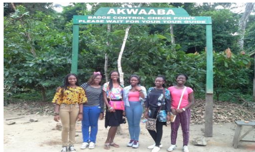
Mentees enjoying an excursion to Kakum National Park, Ghana