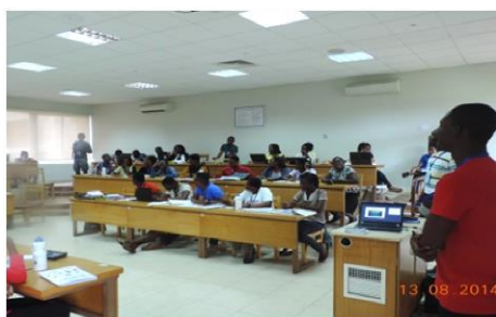
Technology Boot camp at Ashesi University, Berekuso Ghana

Bedrock Human Development Foundation collaborated with the Young Leaders Programme in a mentorship trip to Ghana. The trip was aimed at fostering ethical leadership in young minds. The idea behind the YLP 2014 is to start training young leaders as early as possible, using a “catch them young” approach. Bedrock Foundation facilitated sessions on leadership and leadership skills