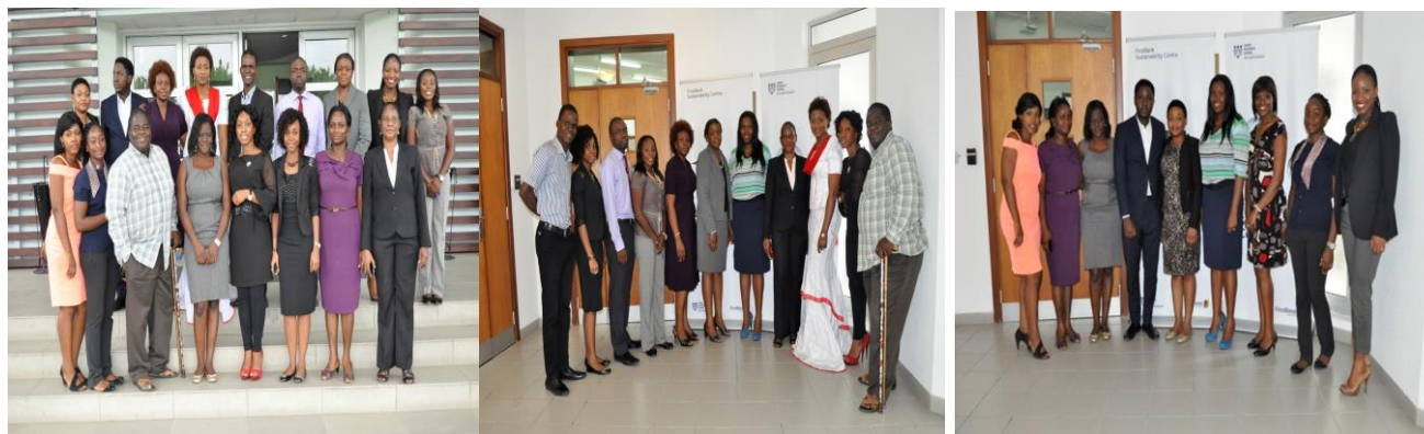
CROSS SECTION OF PARTICIPANTS AT THE LBS SUSTAINABILITY WORKSHOP FOR NGOS