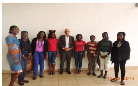
Mentees pose with some of the facilitators after a session

Number of youths worldwide who are neither employed, in school or in training